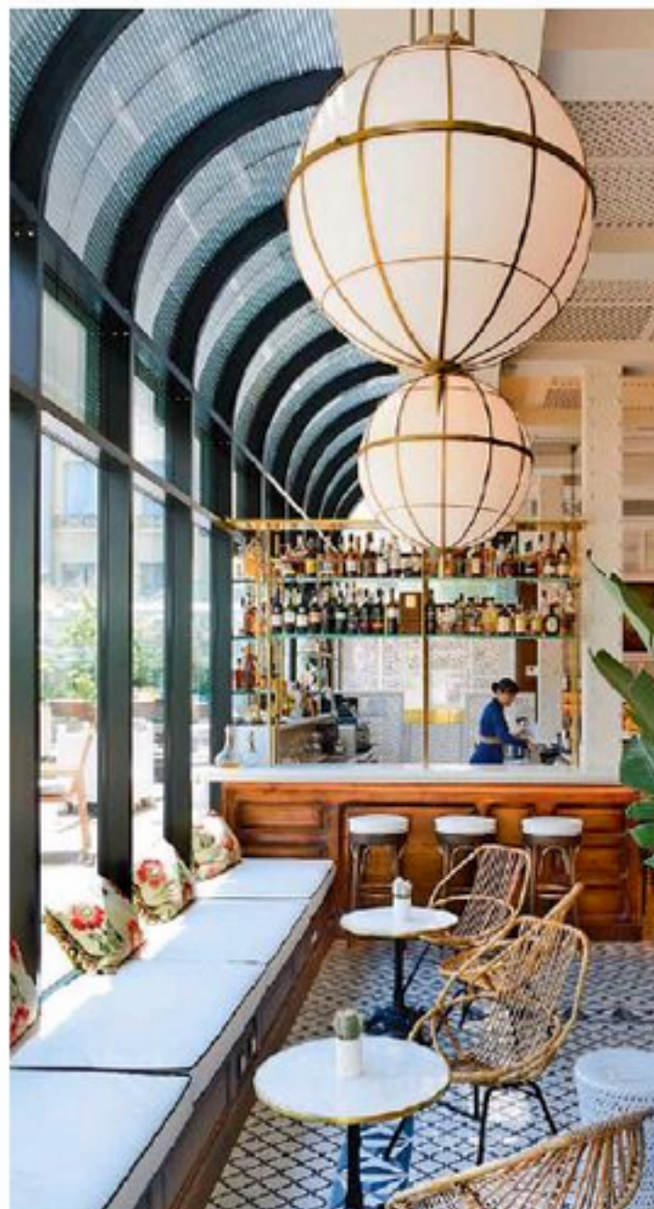
Right: the rooftop pool at Cotton House. Below: the hotel's dining area