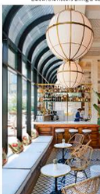
Right: the rooftop pool at Cotton House. Below: the hotel's dining area

Perfect for a Barcelona mini-break, COTTON HOUSE , an Autograph Collection hotel, is grand yet unpretentious. The interiors reference the building's previous incarnation as the headquarters of the city's Cotton Producers Guild, with cotton-themed artwork and vases full of cotton flowers. Bedrooms have balconies shaded by plantation shutters and bathrooms are stocked with Ortigia products. Don't miss breakfast on the garden terrace, or a dip in the small but perfectly formed rooftop pool, which has amazing views of LA SAGRADA FAMILIA . Rooms from £250 per night ( hotelcottonhouse.com ).