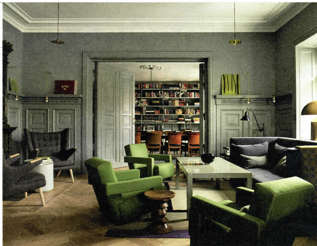
Above Ett Hem, Stockholm

Room to book: For a real treat, book the huge Damask Suite in the former boardroom, with its frescoed ceilings, canopy bed and balcony. Doubles from £171 ( hotelcottonhouse.com ).