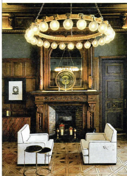
Left Cotton House, Barcelona